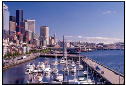
View from the Rooftop Plaza at Bell Harbor

Directions & Travel Information will be provided with confirmation.